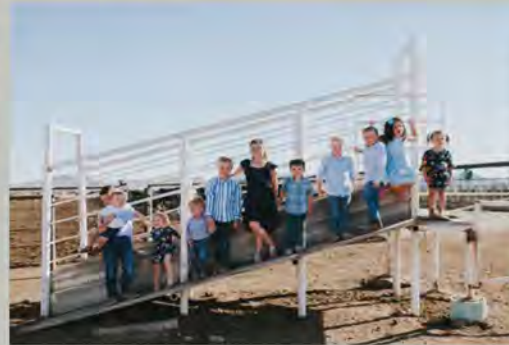
COUSINS ON MEAGAN'S SIDE