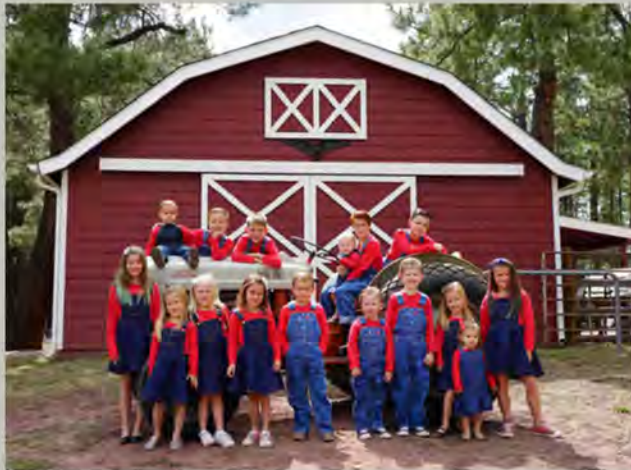
COUSINS ON ANDREW'S SIDE